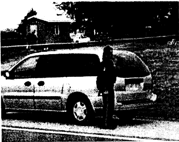
OPP cut off Highway 6 traffic while they investigated the drive-by shooting that began on the Reclamation site.

"This had nothing to do with me personally or my smoke shop or the land that it sits on," said a shuk-