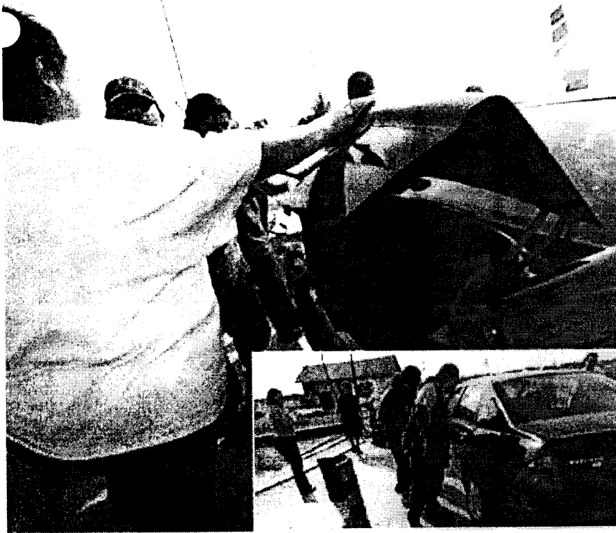
Turtle Island News reporters are searched by some of the "security" personnel who were caught by the newspaper smoking joints at the front gate two weeks ago. Other "security" personnel check out the car and its trunk. They also have sniffing dogs.